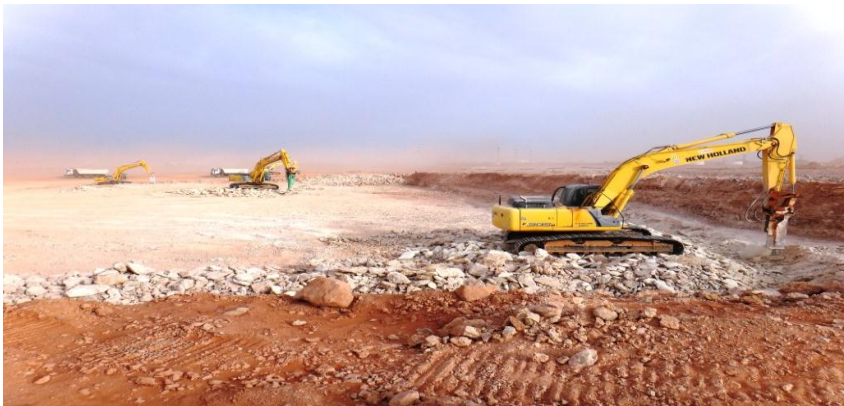
Al-rar Gas Field, recent contract – Value: $700m