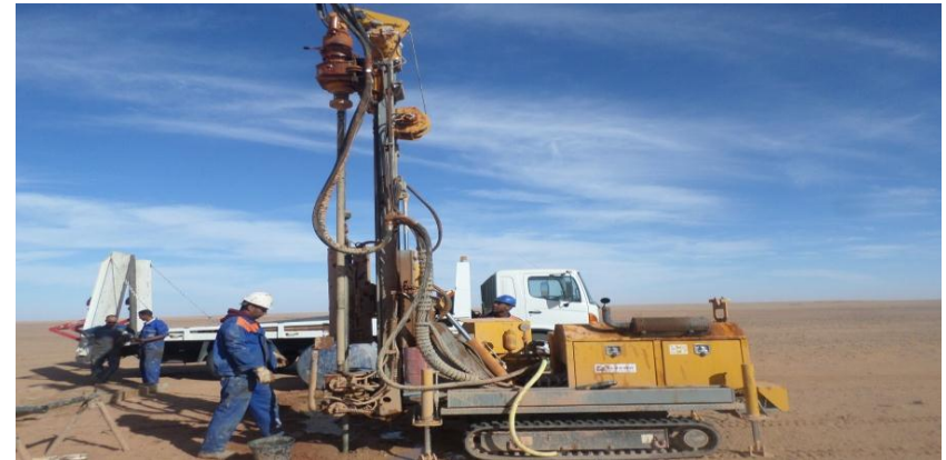
Reggane, recent contract – Value: $1bn