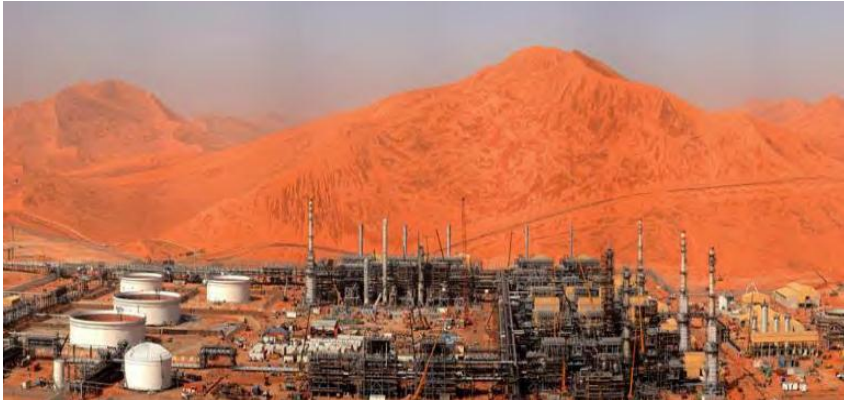
EI Merk Field CPF – Value: $2.2bn