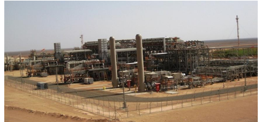
In Salah Development – Value: $1.2bn