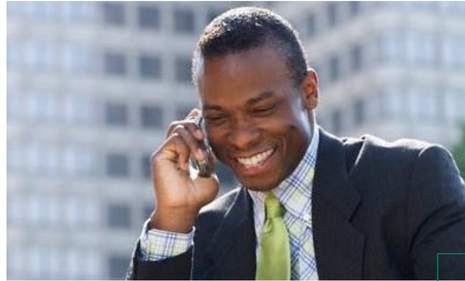
Professionals in Diaspora